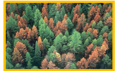
Forest disturbed by bark beetle

Animal Communities - Wildlife species will be affected in different ways. Amphibians may be most at risk as suitable habitat decreases due to warmer, dryer conditions. Bird species, such as the red-cockaded woodpecker, may see a decrease in population as vegetation types change and heat stress makes food sources more difficult to come by. Alternatively, deer populations may increase due to higher survival rates during warmer winters.