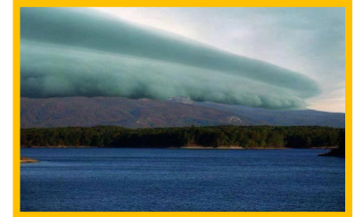
Storm in the Uwharrie