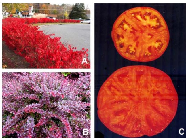
Fig. 4 The spectacular fall color of winged euonymus (A) and Japanese barberry (B). Although they are exotic and invasive, they are extremely popular landscape ornamentals in many regions of USA. Dr. Yi Li's laboratory has developed a seedless fruit technology and used it to produce tomato and other fruits without seed: Conventional tomato plants with seeded fruits (upper panel), Biotech-improved ones with normal- or bigger-sized fruits but no seeds (lower panel).

gene specifically in the ovary or developing fruit (Duan et al. 2006). Because the overproduction of auxin in the plant is restricted in reproductive organs, no obvious side effects have been observed. Plant gene transfer technology also offers tools to produce sterile plants. Targeted expression of a cytotoxin gene in anther, pollen, stigma or ovary has been shown to be highly effective in producing sterile plants (Goldman et al. 1994). Li's lab is currently using both a seedless fruit gene and a cytotoxin gene targeting reproductive organs to produce "super-sterile" (i.e., male and female sterile and with normal sized fruit production) cultivars of winged euonymus and Japanese barberry (Chen et al. 2008).