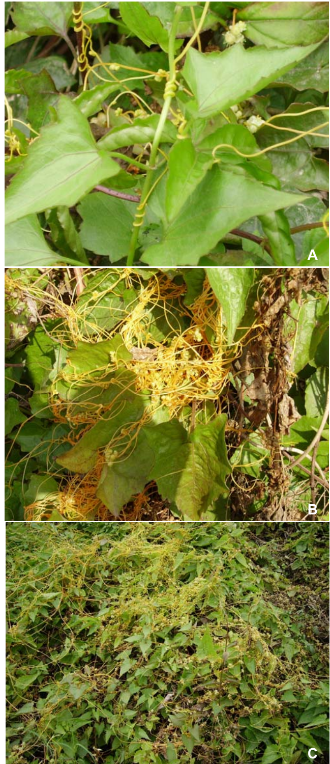
Fig. 2 The obligate parasite, dodder ( Cuscuta campestris ), parasitized Mikania micrantha in Neilingding Natural Reserve, Guangdong, China. (A) an early phase, (B) about 1.5 years later, and (C) a large-scale view.

Ornamental horticulture is a significant source of invasive plants. In the United States, more than 50% of all invasive plants and 85% of invasive woody species were introduced intentionally for landscape use. In many cases, ornamentals with invasive characteristics are popular and economically important. For example, the invasive winged euonymus and Japanese barberry accounted for approximate $20 million in annual sales in Connecticut (Fig. 4) (Li et al. 2004). These plants generally produce abundant fruits and seeds that are distributed by birds and other animals. They adapt to various environments, grow quickly, form dense thickets that