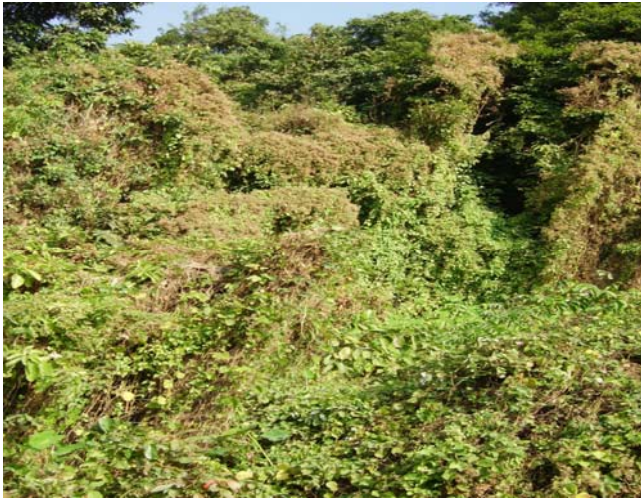
Fig. 1 Invasive Mikania micrantha rapidly grew and produced abundant beige fruits in Neilingding National Natural Reserve, Guangdong, China. It climbed and smothered native species including trees, such as Litchi chinensis , Euphoria longan , Syzygium jambos , Boehmeria nivea and Macaranga tanarius , as well as shrubs and herbs, altering community structure, and composition and reducing local diversity. On the right, Macaranga tanarius , Litchi chinensis and Boehmeria nivea were covered and smothered to death.

ment (Fig. 3). After the death of Mikania , some early-succession native species came back and increased their coverage. The dodder's cover continued to decline, which indicates that the dodder was not able to parasitize these native species (Yu et al. 2011). Moreover, not only the dodder could restrain exotic Mikania (Yu et al. 2009), it also enhanced soil nutrient resources beneficial to native species in the invaded communities (Yu et al. 2008). These findings suggested that Cuscuta may be an effective measure against Mikania and be valuable for the restoration of invaded communities. However, a rigorous risk assessment of dodder's 'non-target' effects needs to be further conducted.