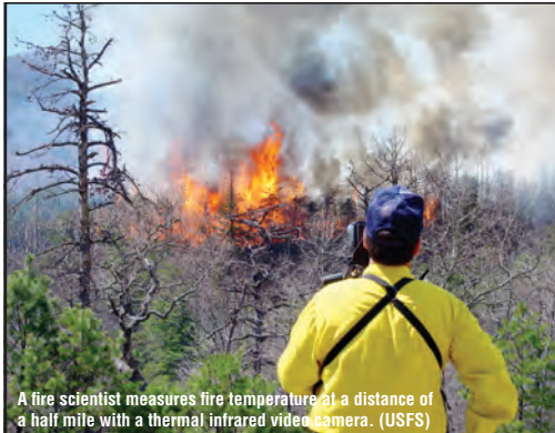
A fire scientist measures fire temperature at a distance of a half mile with a thermal infrared video camera.

Managers and scientists share information about the importance of fire history.