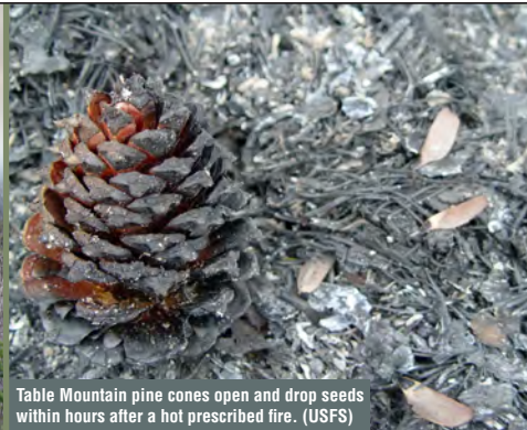
Table Mountain pine cones open and drop seeds within hours after a hot prescribed fire. (USFS)