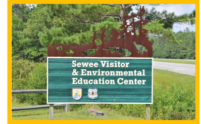
Sewee Visitor and Environmental Education Center