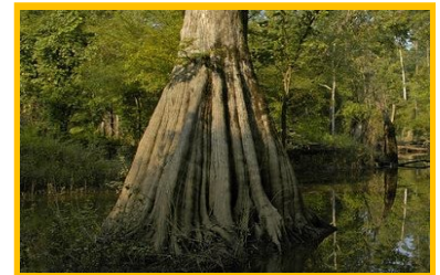
Bald Cypress tree

Response: Protect existing coastal marshes by promoting healthy, native vegetation, restoring natural hydrology, and maintain coastal land buffers to allow for the natural inland migration of salt marshes as sea levels rise.