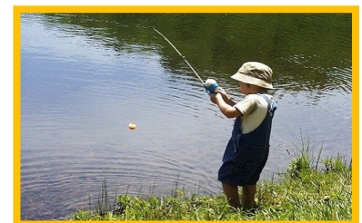
Fishing in GWNF