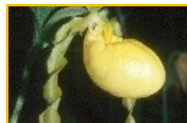
Yellow Lady's Slipper