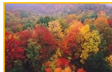
Fall Forest Colors Daniel Boone

Recreation - Changes in plant and animal communities as mentioned above may make some areas less attractive to recreation users. Tick and mosquito populations may increase due to warmer winters and extreme heat may result in less visitors during high heat conditions.