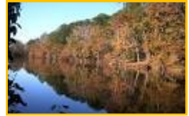
Angelina National Forest

Response: Communicate early warnings for extreme weather to protect vulnerable groups from health impacts, such as heat