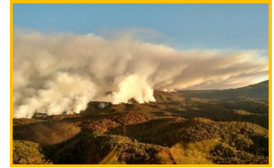
Wildfire in the Southeast US

Response: Work with local indigenous populations and cultural groups to provide resources for them to adapt to the climate driven changes on their cultural sites.