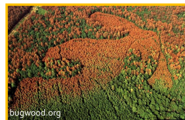
Southern Pine Beetle impacts