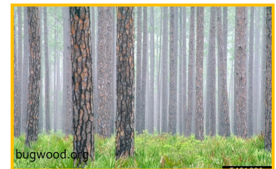
Longleaf pine Forest