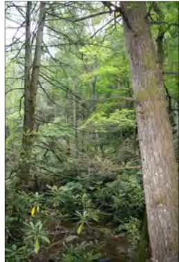
Figure 1: Eastern hemlock is an important species in riparian areas; this stand is at South Mountains State Park, N.C.

To guide gene conservation strategies for this imperiled conifer and to better understand its genetic architecture, we conducted a range-wide genetic variation study (Figure 2). For details, see Potter et al. (2012).