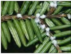
Hemlock woolly adelgid

4 Forest Health Protection, U.S. Forest Service, Asheville, NC 28804