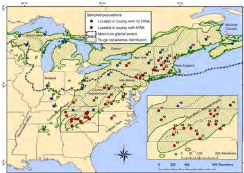
Figure 2: Sampled populations of eastern hemlock; the dashed line depicts the maximum extent of the Wisconsinian glaciations, ca. 18,000 years ago.