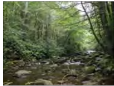
Eastern hemlock forest