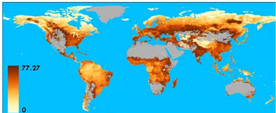
1 Global wildfire risk to water security based on fire activity, vegetation, geography, water availability and socio-economic development

Note: Wildfire risk to water security is shown on a scale from 0 (minimum risk) to 100 (theoretical maximum risk potential).