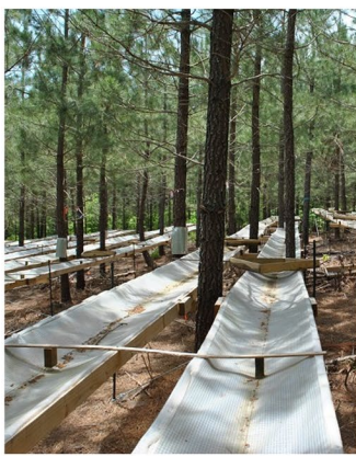
Figure 1. The native range of loblolly pine (shaded area) in the Southeast United States and the locations of the through-fall reduction and fertilization experiments (green, left). Throughfall reduction troughs (-30%) at the Virginia study site (right).

at 432 kg ha<sup>-1</sup>), phosphorus (diammonium phosphate at 140 kg ha<sup>-1</sup>), potassium (potash at 112 kg ha<sup>-1</sup>). Micronutrients were supplied as granular oxysulfate micronutrient mix (Southeast Mix, Cameron Chemicals, Inc., Virginia Beach, VA, USA) at a rate of 22.4 kg ha<sup>-1</sup>, which contained 5% boron, 2% copper, 6% manganese, 6% sulfur, and 5% zinc. The fertilizers were broadcast applied by hand in March and April of 2012 (Will et al., 2015).