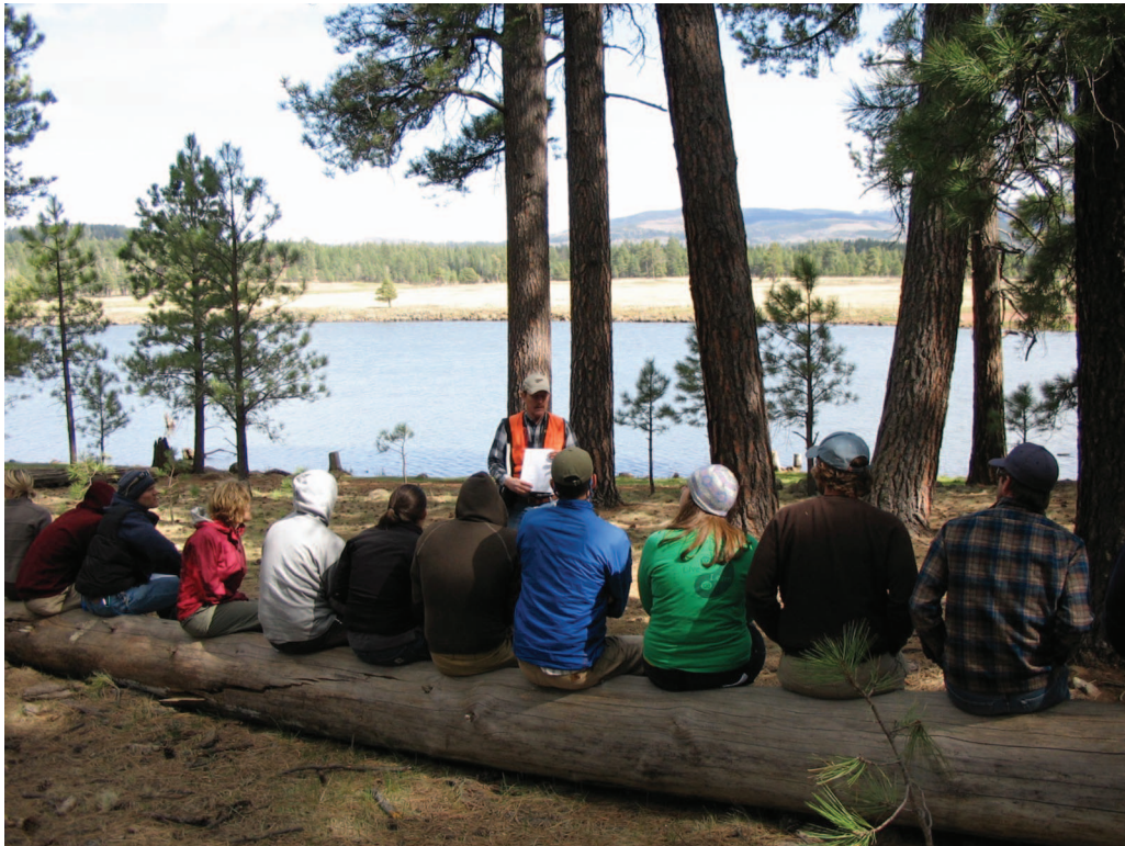
Figure 3. The outdoor setting gives students a better grasp of how tribal goals and objectives and good forest management intersect on the reservation.