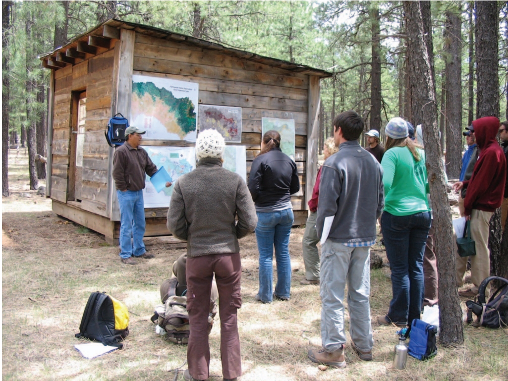
Figure 2. Forestry graduate students are orientated to the landscape at the beginning of each field visit. Students listened to the different management needs for different forest types found on the reservation.