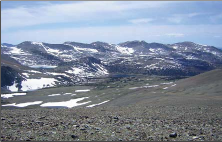
Reduced snowpack associated with warmer temperatures and changing precipitation patterns will complicate water management; conditions typical of late July or early August are seen in early June 2007 (an extremely dry year) in the upper Tuolumne drainage basin in California, the source of San Francisco's municipal water

wild and scenic river management. Further proactive approaches will need to be appraised continually as the climate continues to change and ecological systems respond; such continual changes may also necessitate a modification of the forest management goals.