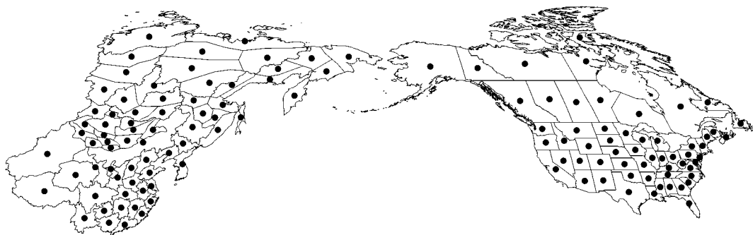
Figure 1 Geopolitical units used to document exotic plant species distributions in Eastern Asia (EAS) and North America (NAM).

The statistical contribution of each independent variable to variation in geographical range was determined by analysis of