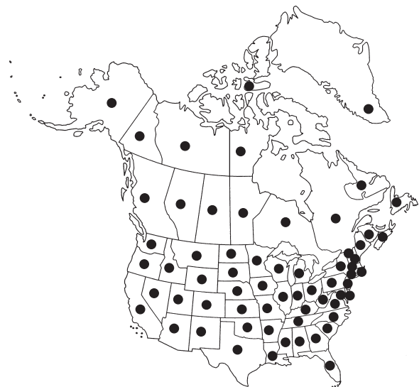
Figure 1 Geographical distribution of the 64 state and provincial floras included in this study. The dots represent the 64 geographical units used in this study.

Each alien species was characterized with respect to habitat (wetland versus upland), invasiveness (invasive versus non-invasive), life cycle (annual/biennial versus perennial) and habit (herbaceous versus woody). Plants included in the category of wetland habitat are those classified as aquatic, floating, submerged, or wetland plants in Kartesz (1999); all other plants were included in the category of upland habitat. A species was considered as 'invasive' if it was included in Swearingen (2008) or USDA (2008); all other plants were