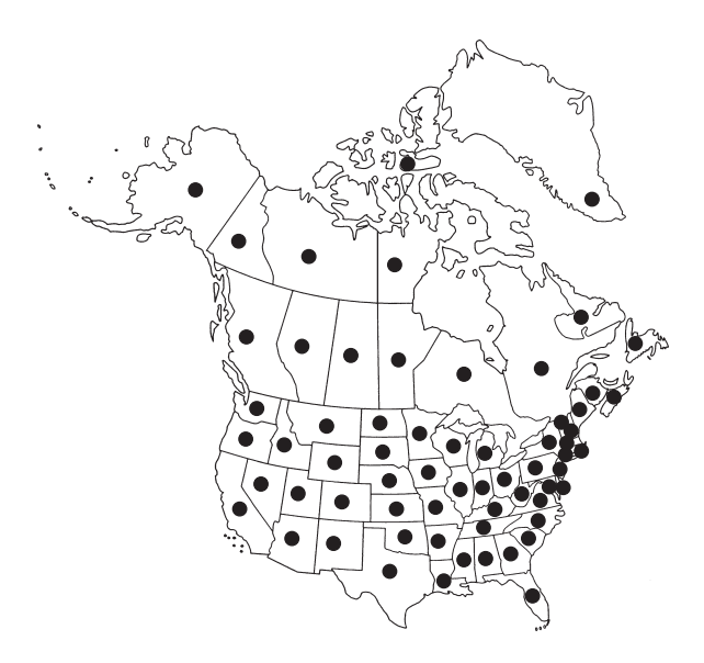
Figure 1 Geographical distribution of the 64 state and provincial floras included in this study. The dots represent the 64 geographical units used in this study.

Each alien species was characterized with respect to habitat (wetland versus upland), invasiveness (invasive versus noninvasive), life cycle (annual/biennial versus perennial) and habit (herbaceous versus woody). Plants included in the category of wetland habitat are those classified as aquatic, floating, submerged, or wetland plants in Kartesz (1999); all other plants were included in the category of upland habitat. A species was considered as 'invasive' if it was included in Swearingen (2008) or USDA (2008); all other plants were